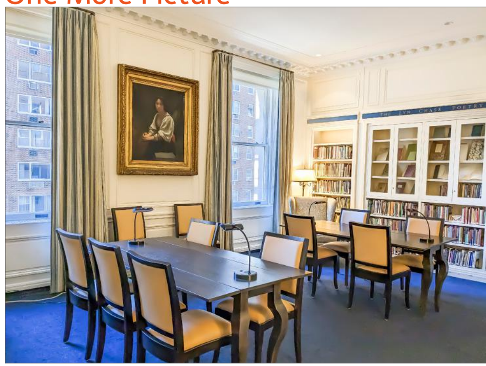
We're pleased to add these handsome and comfortable new chairs to the Whitridge Room on the third floor. Drop in to read or write there!