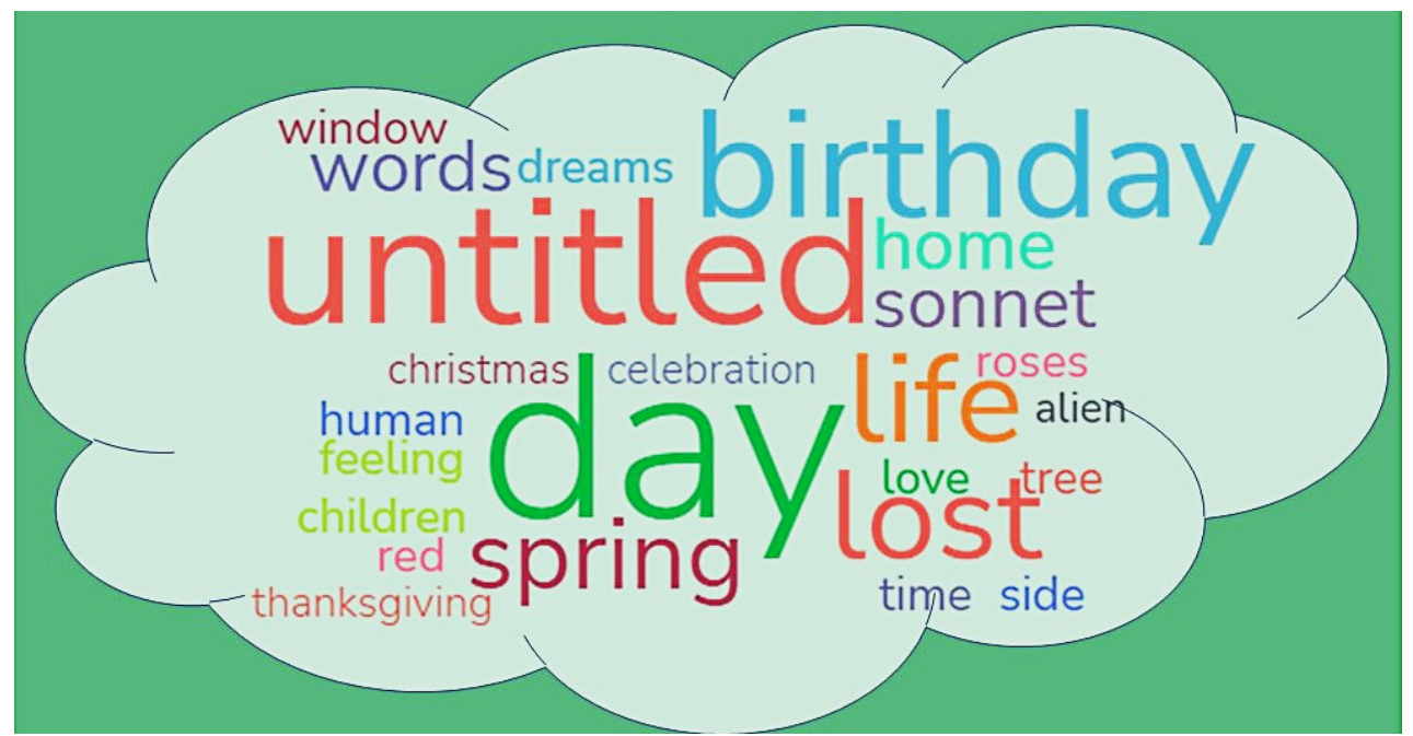
The bigger the word appears, the more it appeared in titles of this year's 344 Young Writers Awards entries.